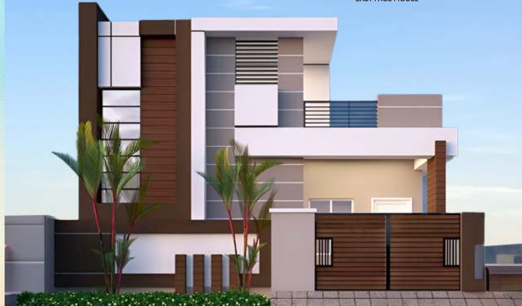
EAST FACE MODEL