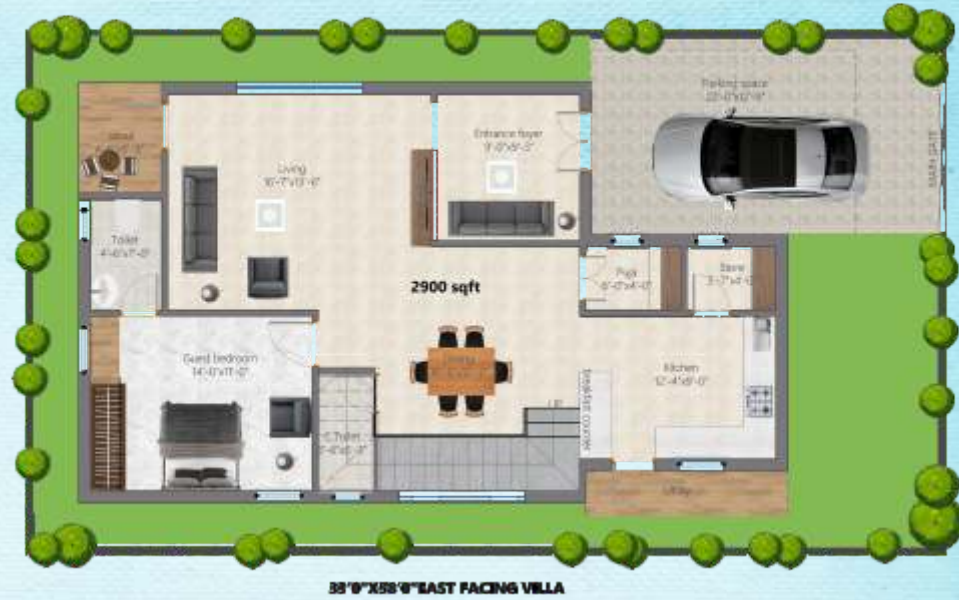
EAST FACE VILLA GROUND FLOOR